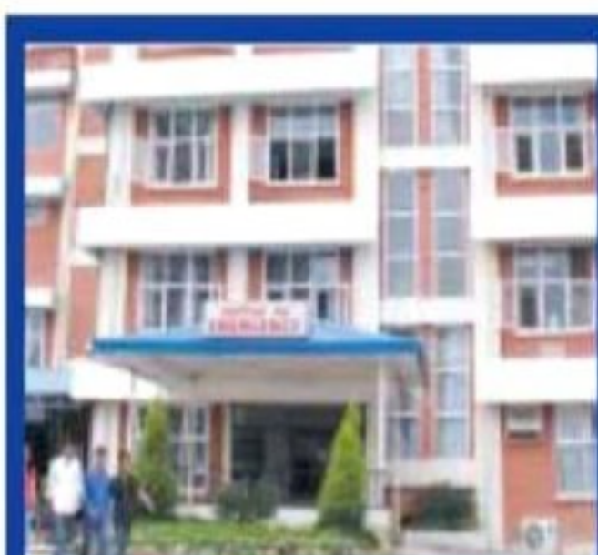
KIST MEDICAL COLLEGE