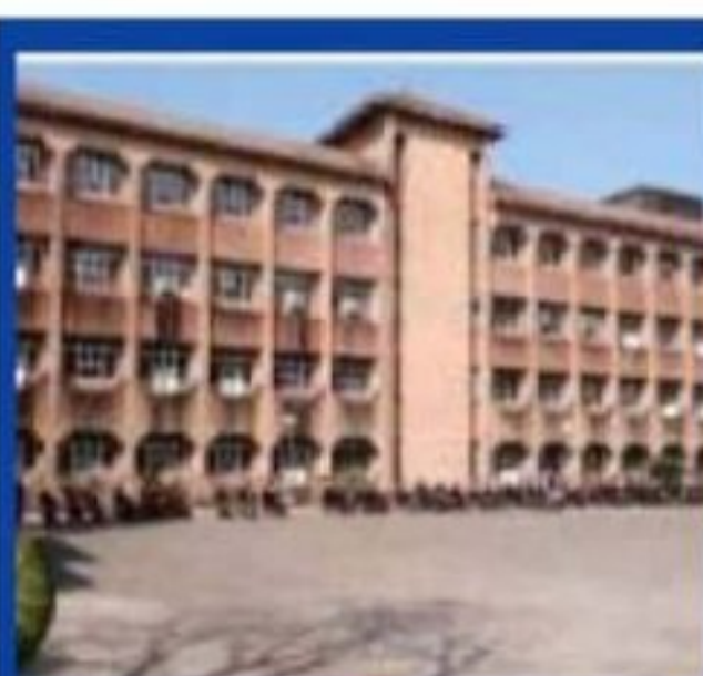
B.P. KOIRALA INST. OF HEALTH SCIENCE