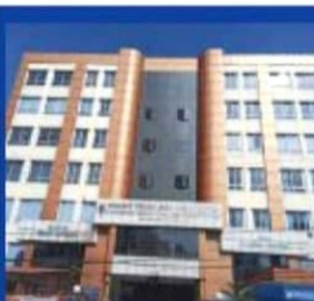
KATHMANDU MEDICAL COLLEGE