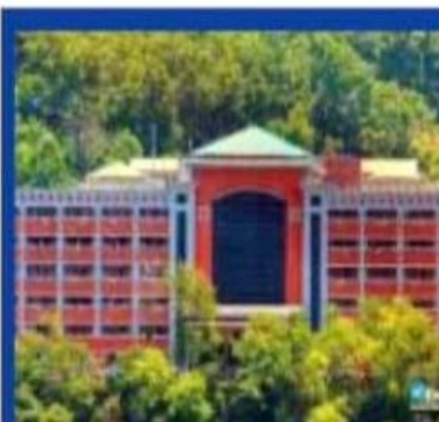
MANIPAL COLLEGE OF MEDICAL SCIENCES